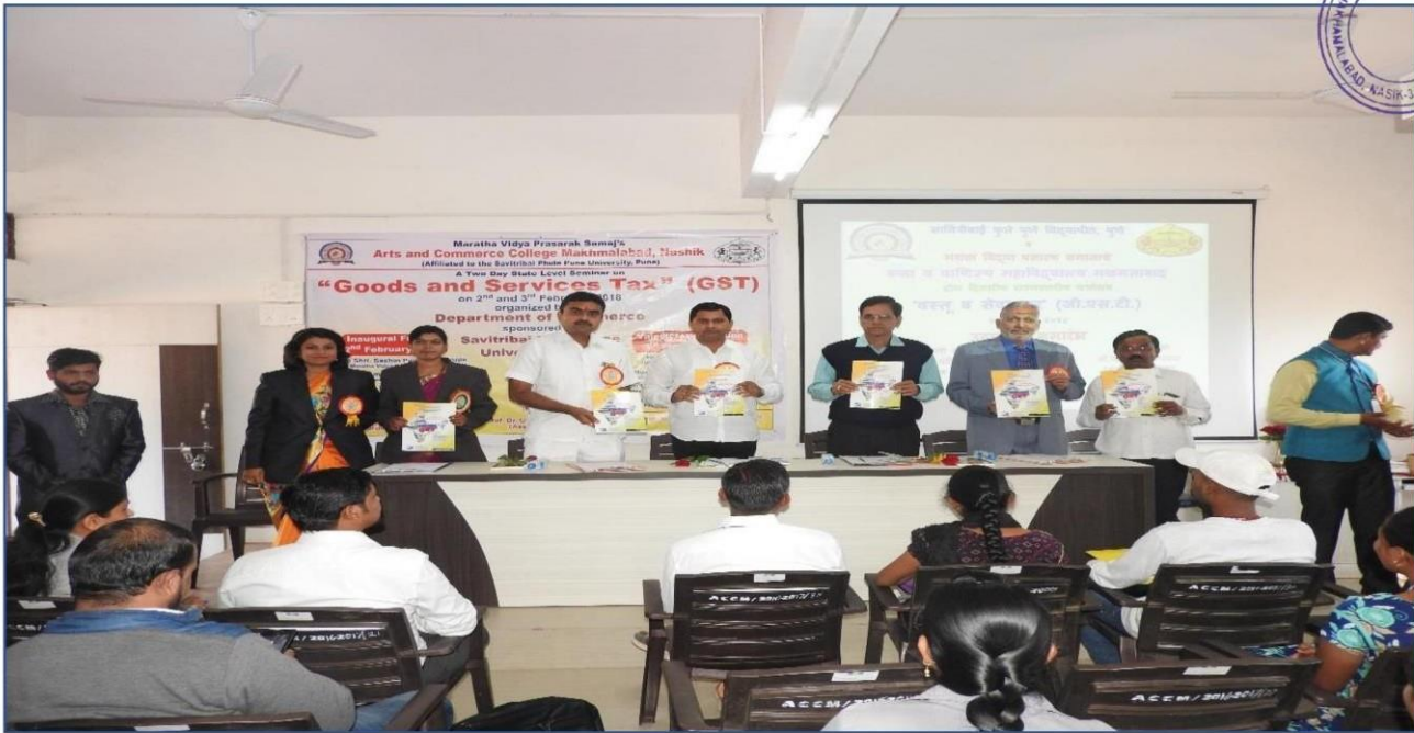
Journals Publication Ceremony of Two Day's State Level Seminar on Goods & Service Tax (GST) on 2 nd & 3 rd February 2018