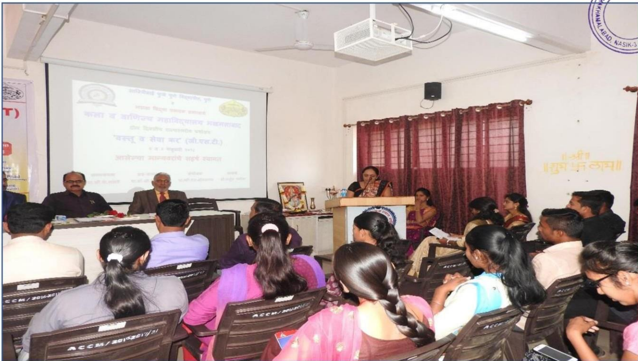
Dignitaries and Participant of Two Day's State Level Seminar on Goods & Service Tax (GST) on 2 nd & 3 rd February 2018