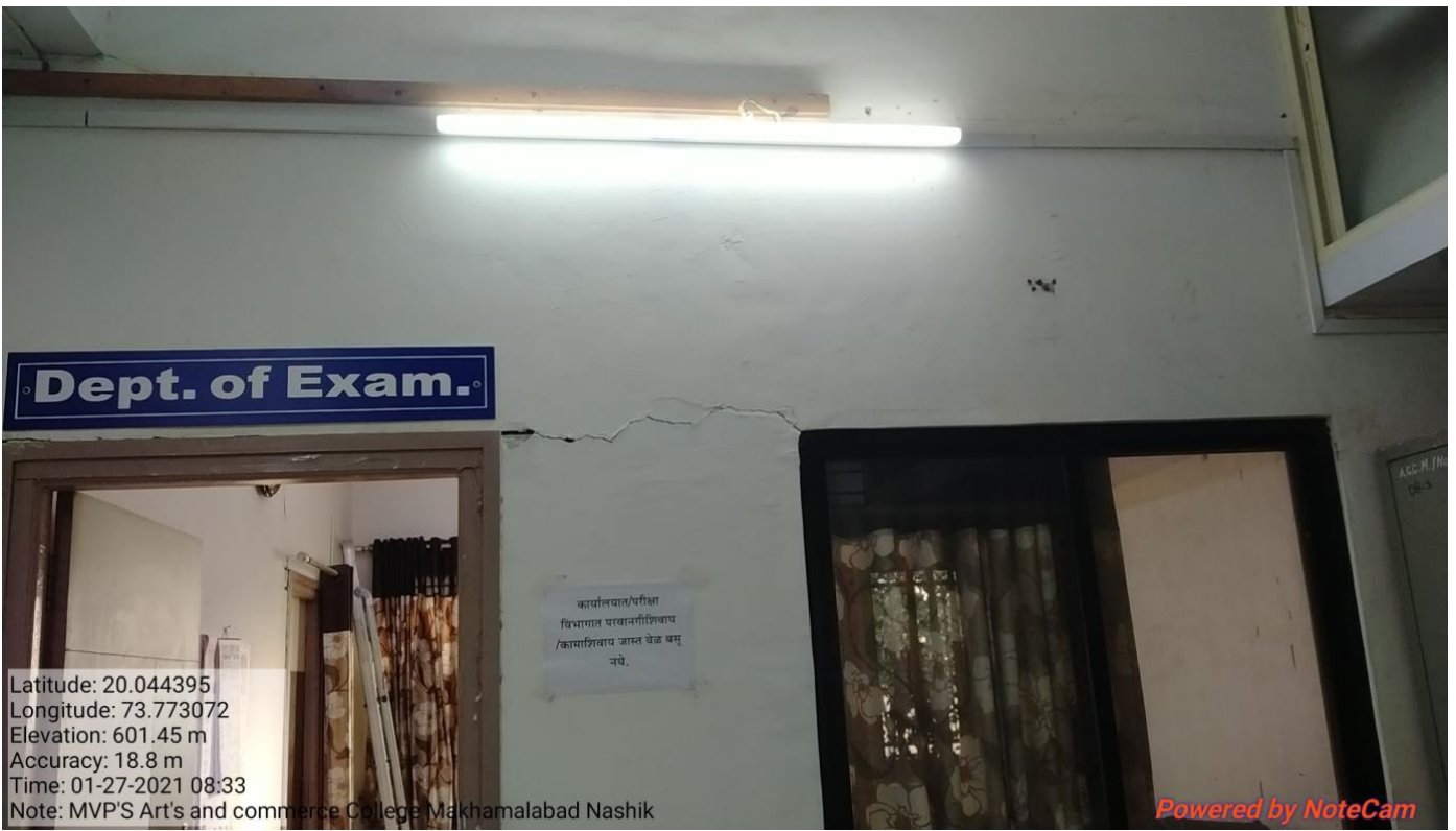
Use of LED for Energy conservation