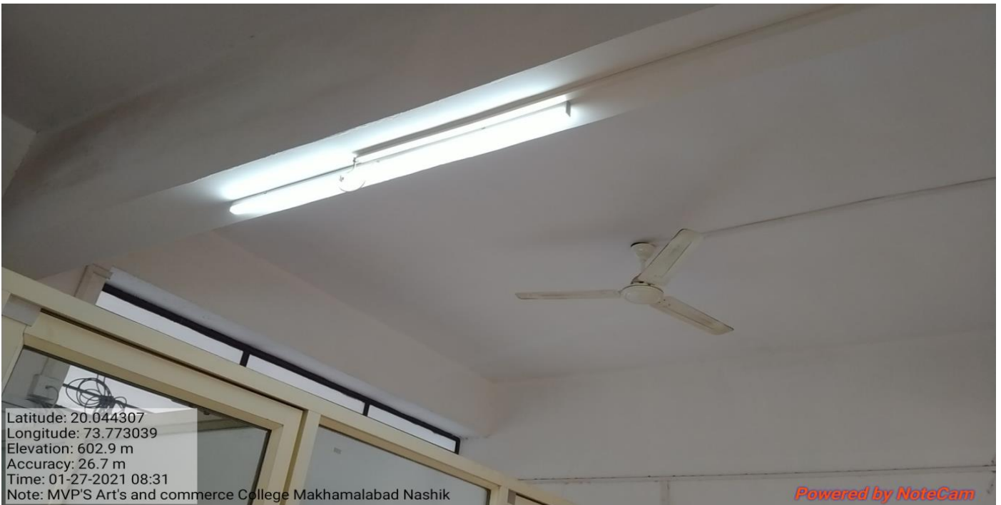
Use of LED for Energy conservation