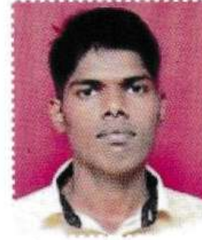
बेंडकोळी समाधान एफ.वाय.बी.कॉम. द्वितीय