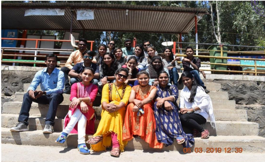
Student were Participated in Educational Study Tour on 06/03/2019