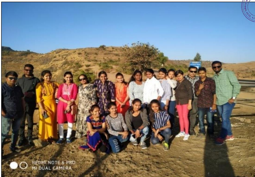
Student and Staff were Participated in Educational Study Tour on 06/03/2019

Pratibha Principal Arts, and Commerce College, Makhamalabad, Nashik